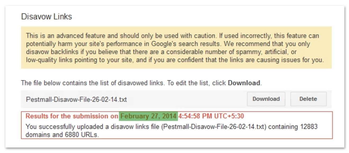
Snapshot of the 3rd and final Disavow file submitted on 27th February 2014

The entire process of recovery took 5 months and 3 iterations for Google to finally lift the Manual Penalty. The first reconsideration request was sent in December 2013 followed by the second in Jan 2014 and the third in Feb 2014.