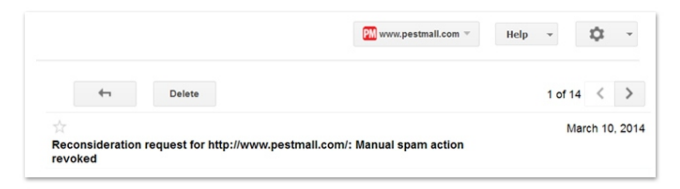
Snapshot confirming Manual Penalty revoked on 10th March 2014